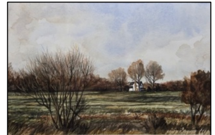
Best of Show: Fall Afternoon